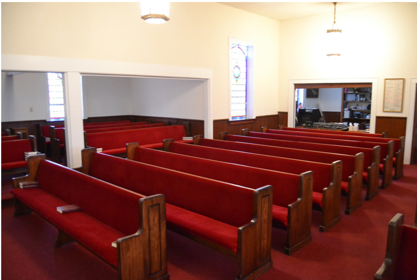
The sanctuary before renovations (pictures taken August 24, 2013)