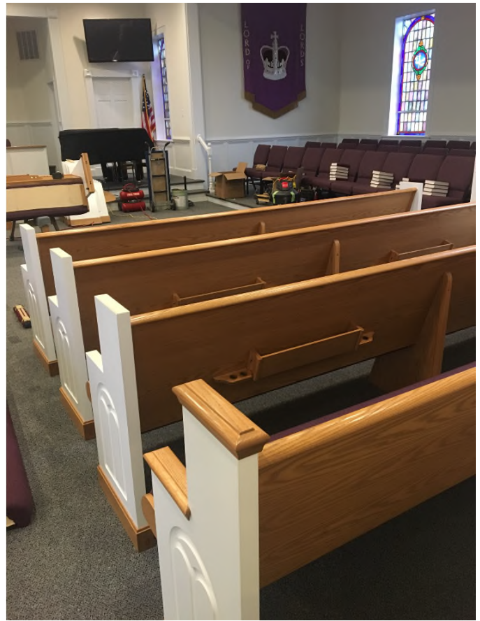
New pews in the sanctuary