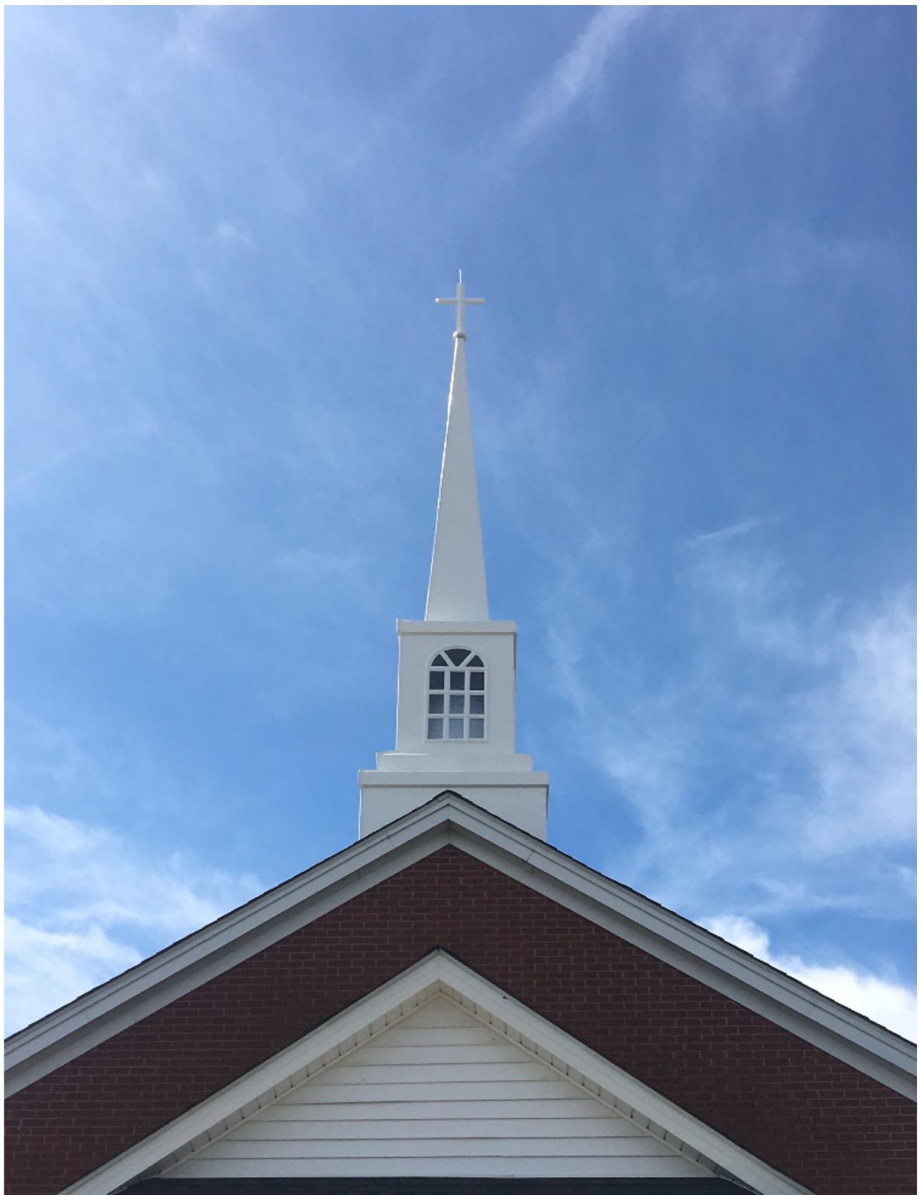
The new steeple