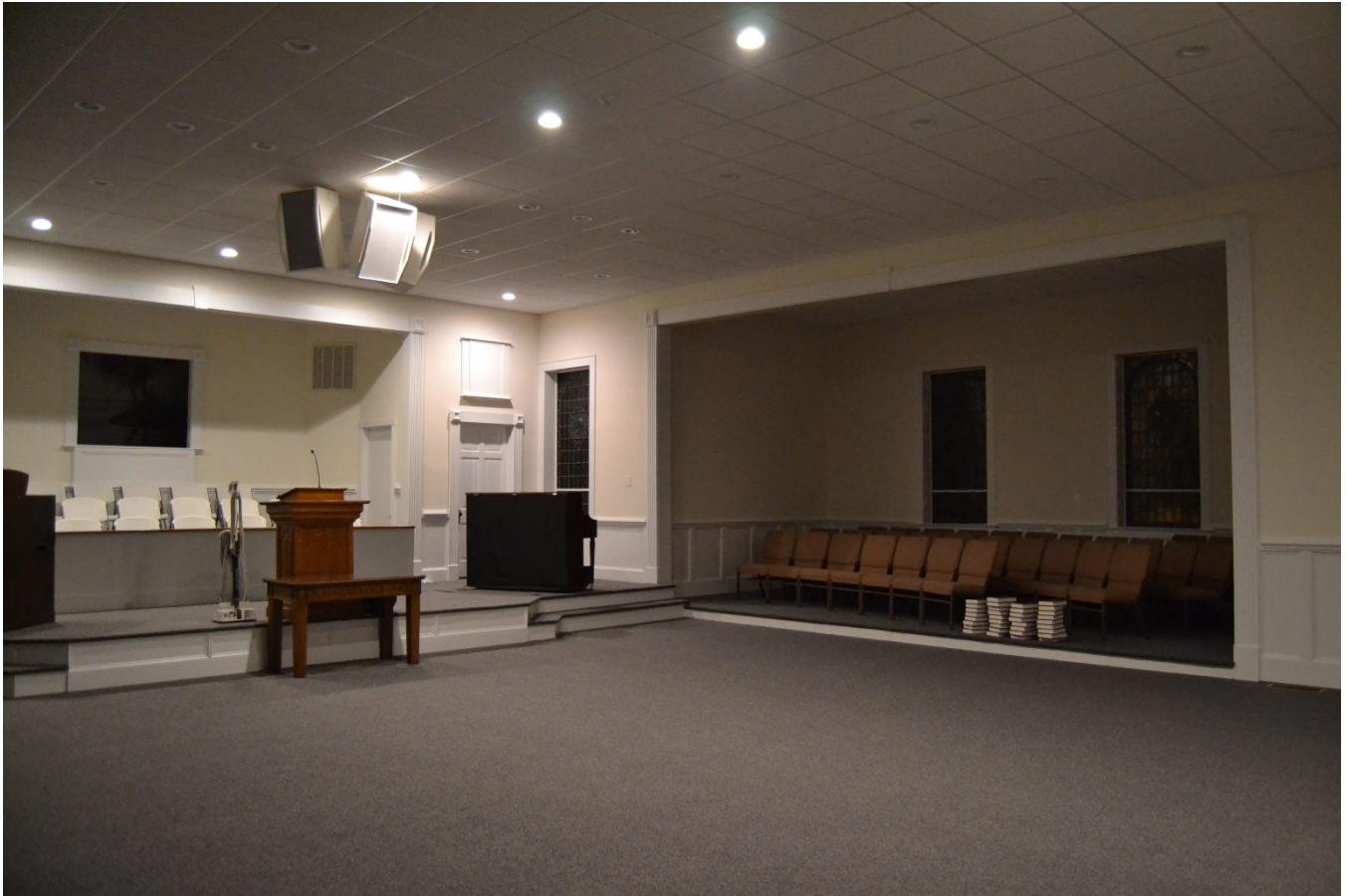
The sanctuary after renovations (pictures taken February 2014)