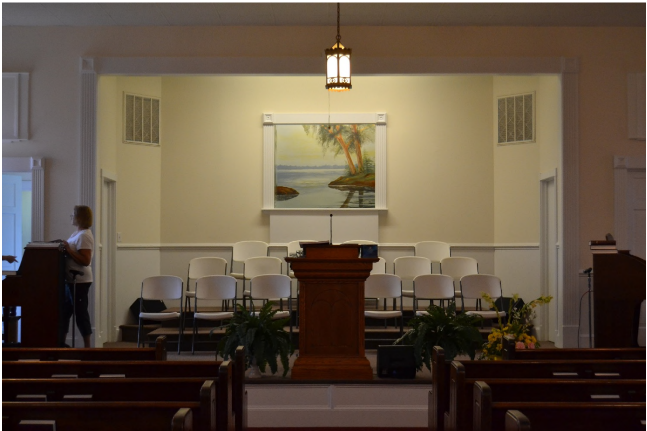
The choir and pulpit area after construction (picture taken August 24, 2013)

The choir and pulpit remodeling were completed.