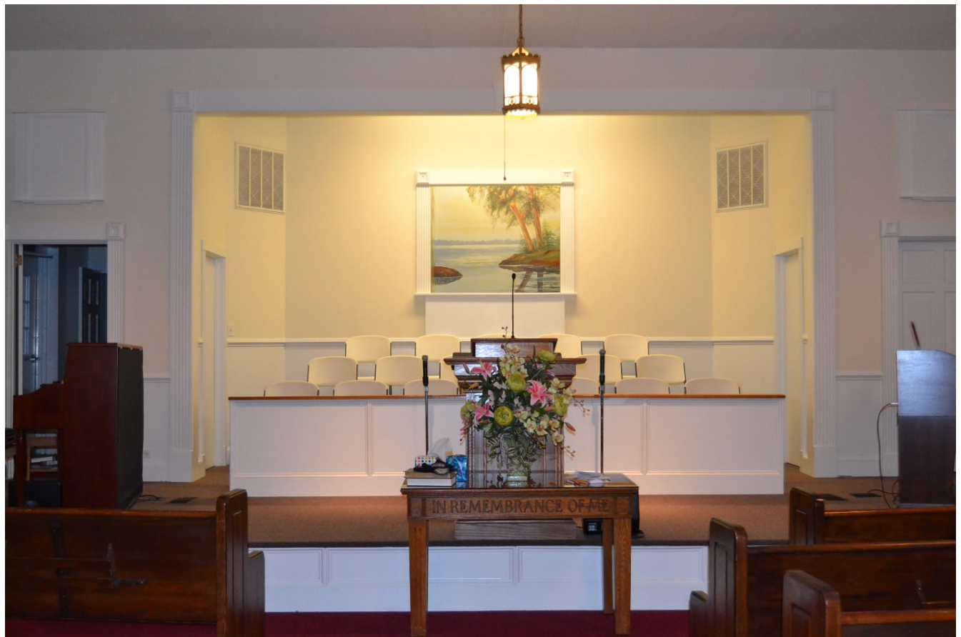
The choir and pulpit area after construction (picture taken January 6, 2014)

September 2013 Gary Smith was voted in as a new deacon and would be ordained at a later date.