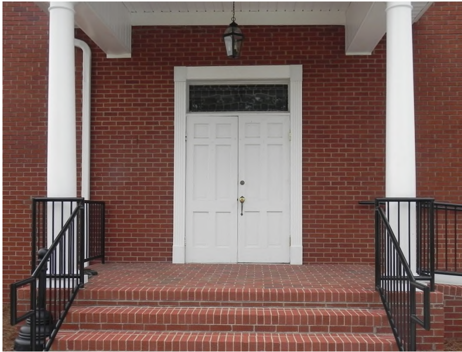
The front doors before renovations (picture taken March 2013)