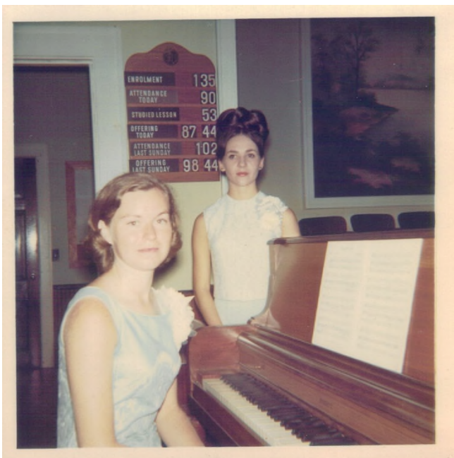
This photo (taken August 1966) shows how the attendance was displayed on the wooden display board in the background.