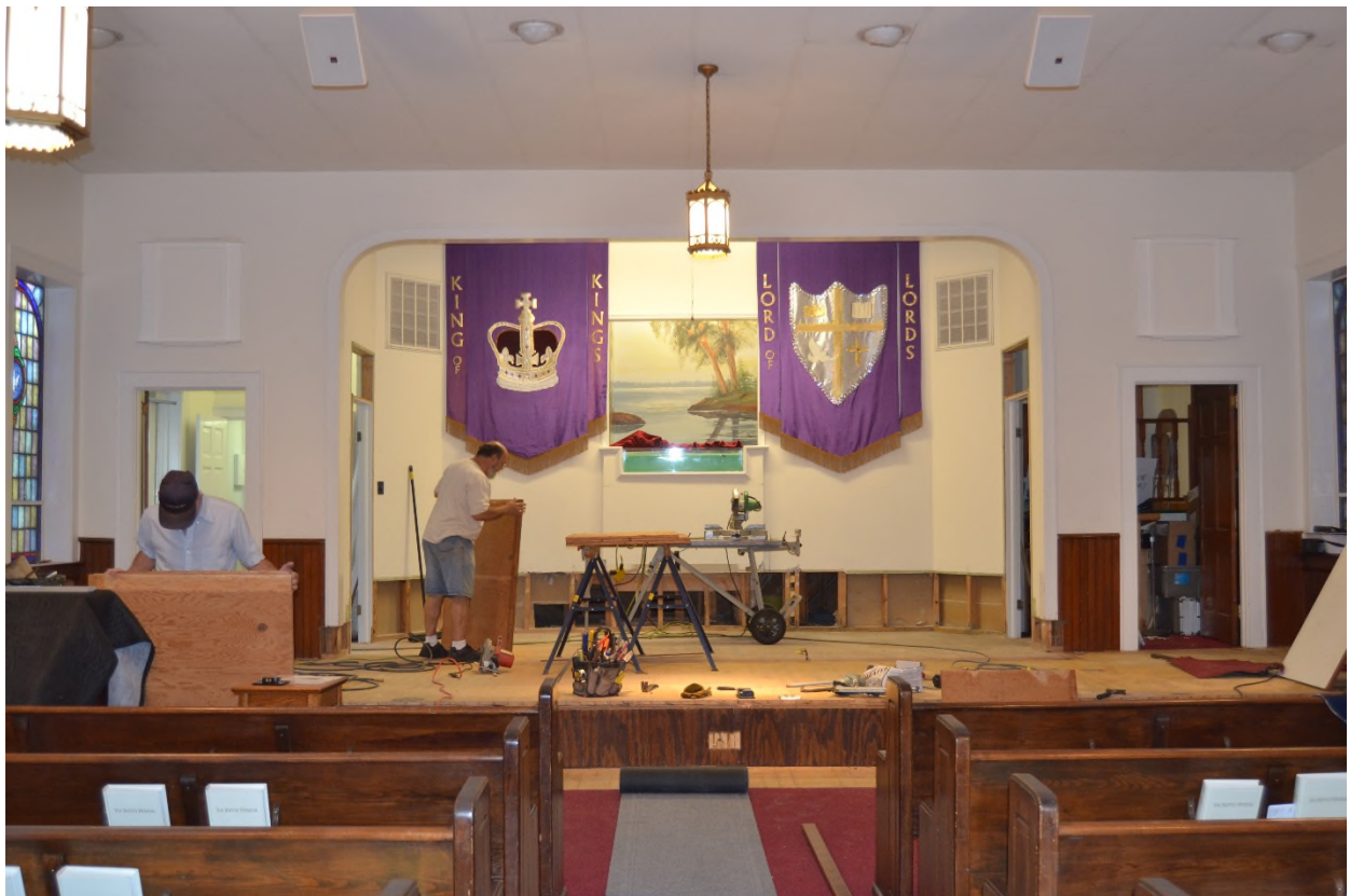
The choir and pulpit area during construction (picture taken April 30, 2013)

April 29, 2013, work began to remodel the sanctuary of the church beginning with the choir and pulpit area.