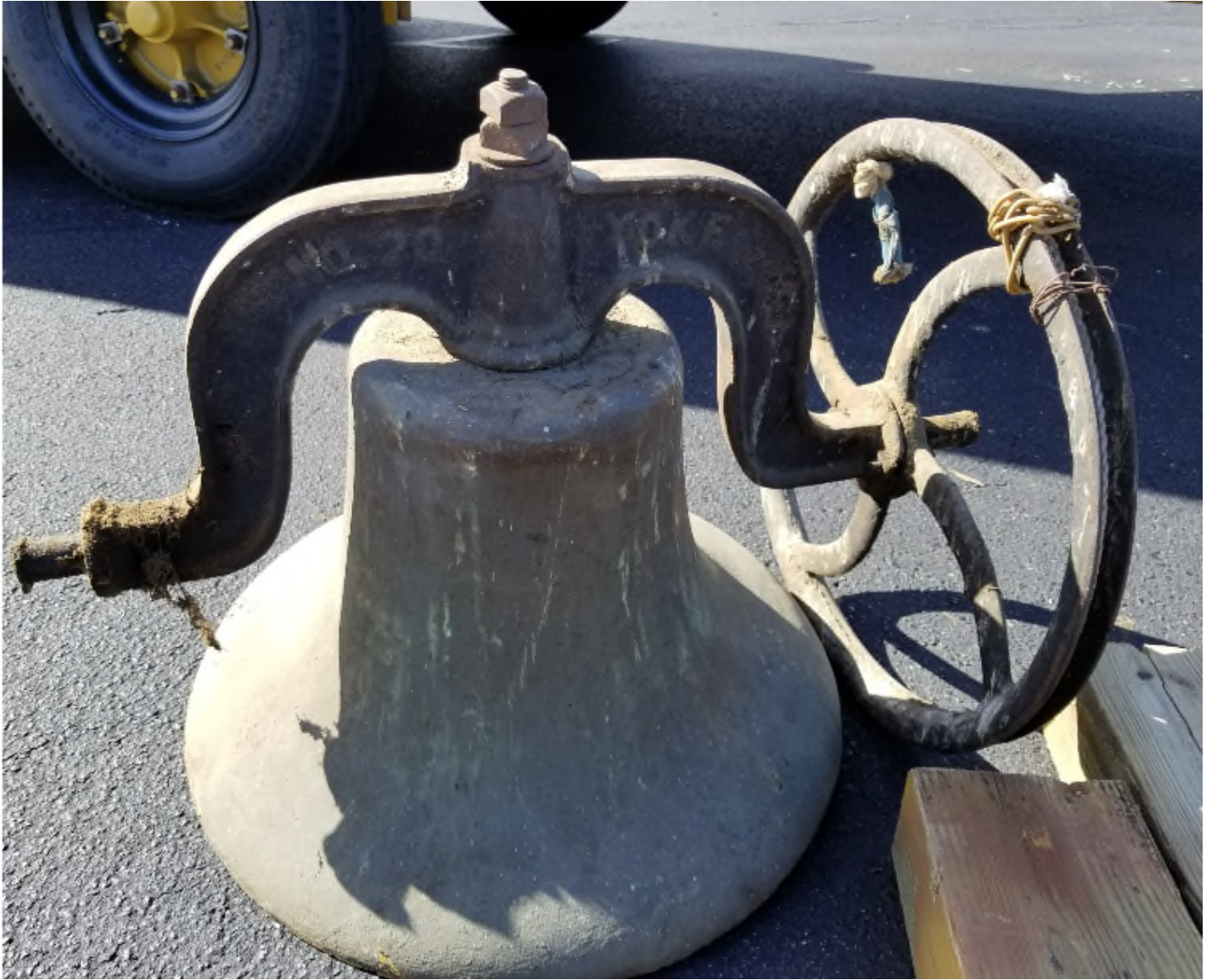
The old bell after it was removed.