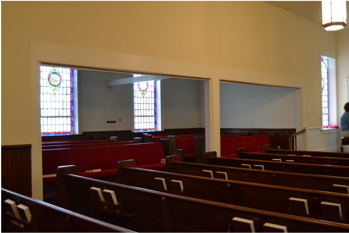
The sanctuary before renovations (pictures taken August 24, 2013)