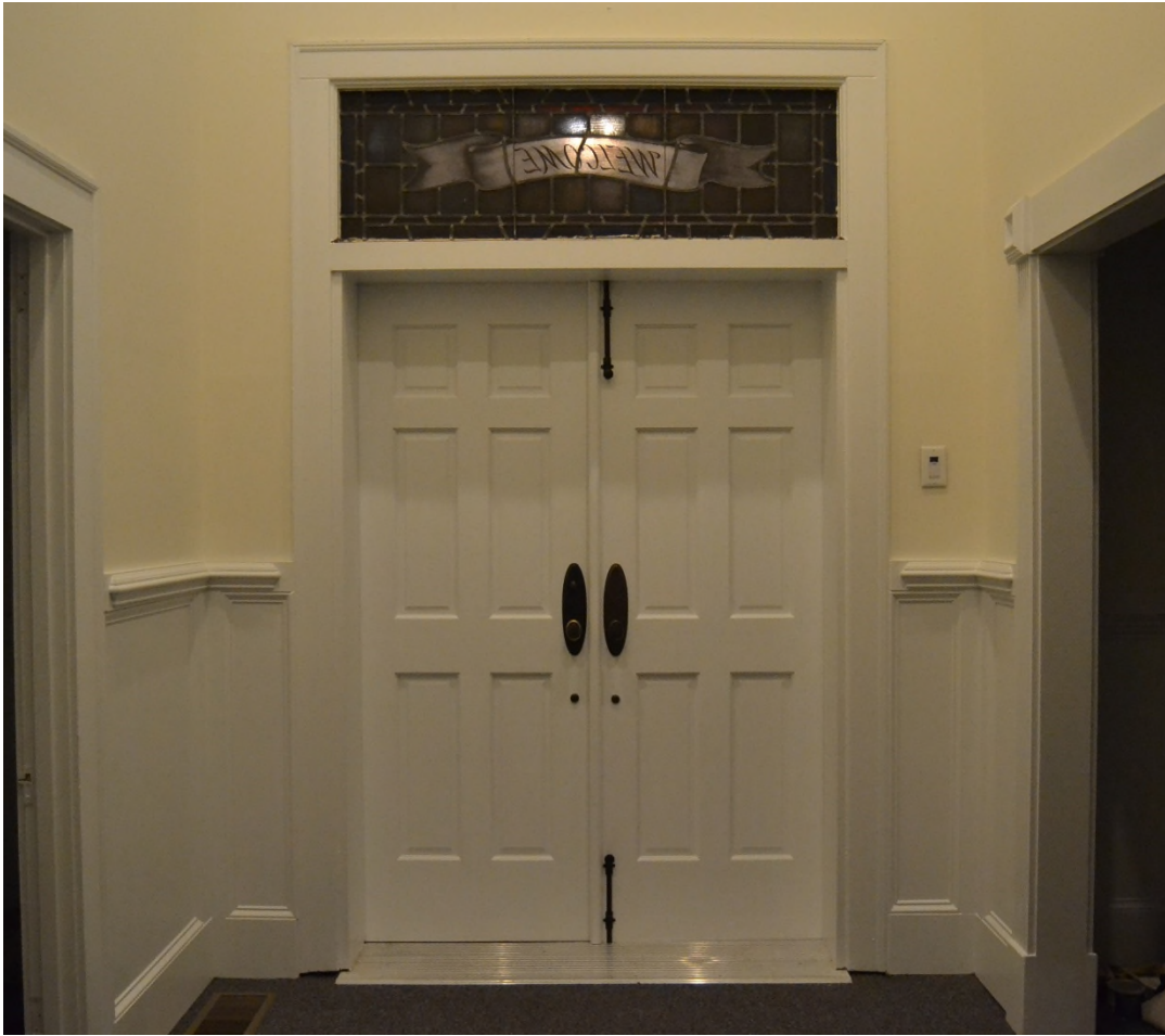
The front doors after renovations (picture taken February 5, 2014)