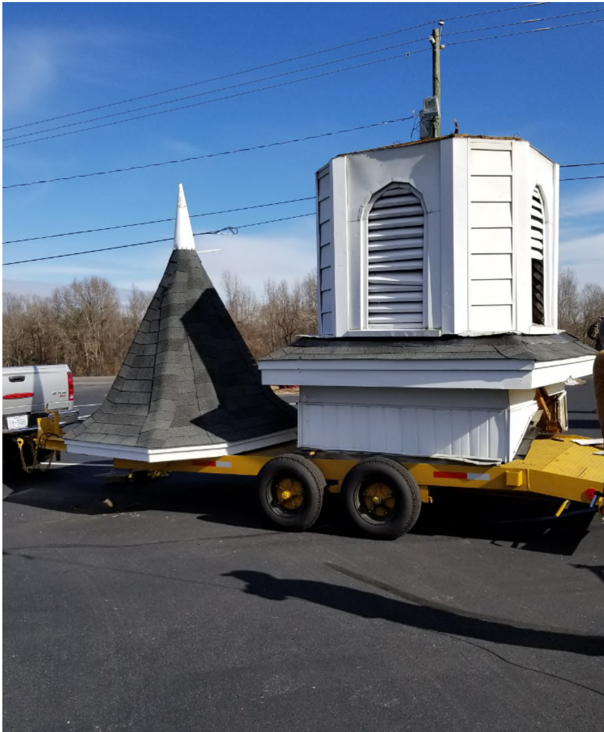
This is the old steeple after it was removed.

March 5, 2018 the new steeple arrived and was installed.